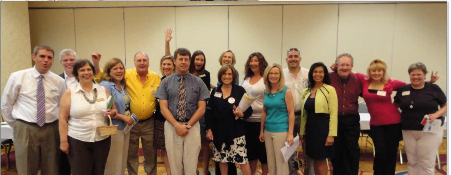
(Below) The July Monthly Luncheon, "Accelerated Networking" was followed by some power-networking members. This group met half the room in the usual round-the-tables networking, then met everyone on their same side of the table. We're talkin' serious networking!!