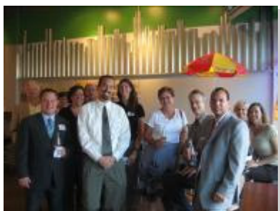
Chamber members enjoy a PROGRESSIVE After Hours, with a cold bottle of soda at Hot Spot Hot Dogs.

Congratulations to the following chamber members who were chosen for the BUSINESS OF THE MONTH: